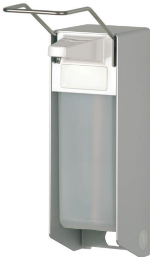
ingo-man ® classic